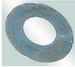
ANGLE DISK P7100