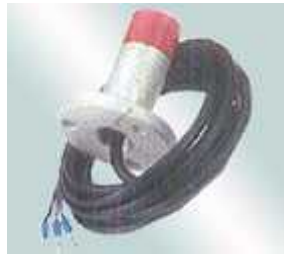
SENSOR FOR MOTOR LETOFF KAS