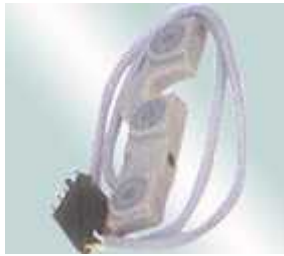
PFR SENSOR D1 SMP