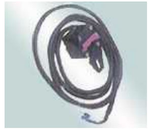
SENSING HEAD SFW