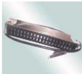
ELECTROMAGNETIC 20 (MAGNET BAR)