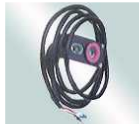
SENSING HEAD SFW