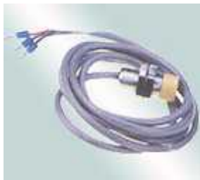
WEFT MIXER FOR COLOR CHANGE MWS