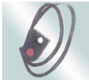
PROJECTILE SENSOR PU