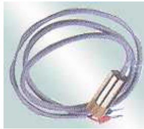
FA SENSOR CI