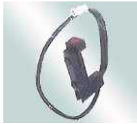
PROJECTILE SENSOR PU CI