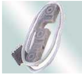
PFR SENSOR D2 SMP