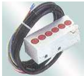
ANGEL SENSOR WIS